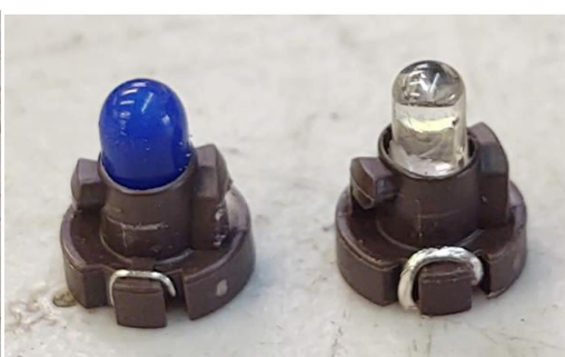
OEM bulb on the left, LED bulb on the right.