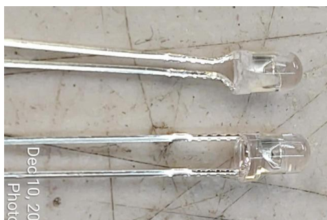
Slightly bent leads to match the bulb base.

Slight bending of the leads was necessary to mate with the holes in the base of the bulb holders. Also, shaving of the plastic LED base circumference was necessary for the LED to fit in the bulb base snugly.