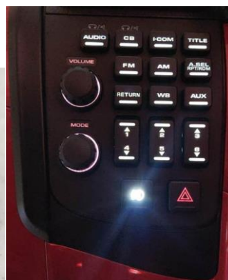
After repair and reassembly.

The only other thing I needed to be sure of was to insert the LED bulb assembly so the polarity was correct between the circuit board and the bulb. I think the entire job only took about two hours.